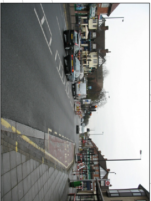
EAST BOUND TRAFFIC DIRECTION