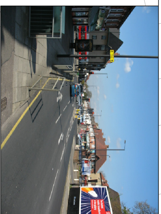
WEST BOUND TRAFFIC DIRECTION